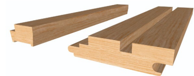
Figure 3. Isometric section view of the PROFILE - CLIFF (Mini & Standard)