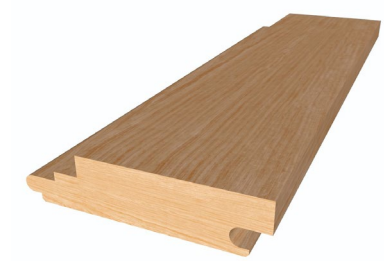
Figure 1. Isometric section view of the PROFILE - HORIZON (Standard).