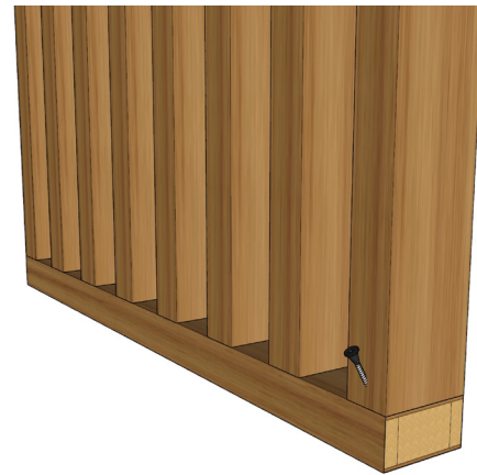
With solid wall cap