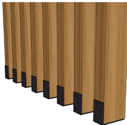
With black metal bracket

For details, please refer to Woodzco LINEAR collection's Installation Guide.